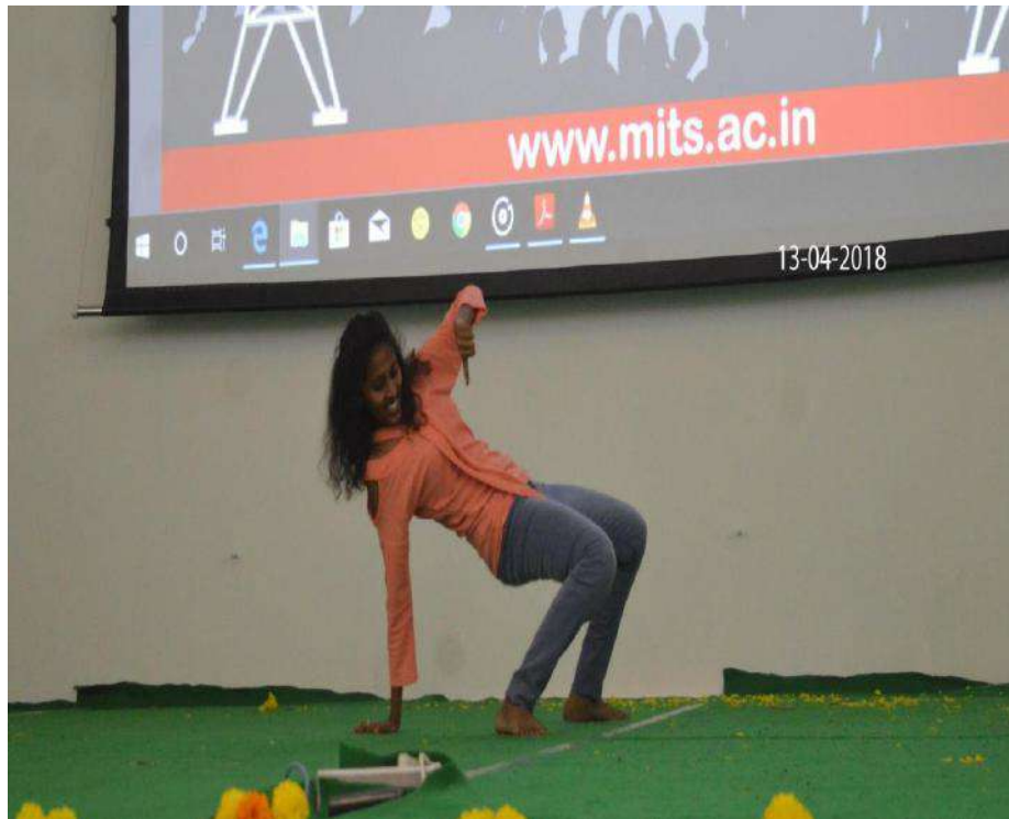
Girl performing during CITA