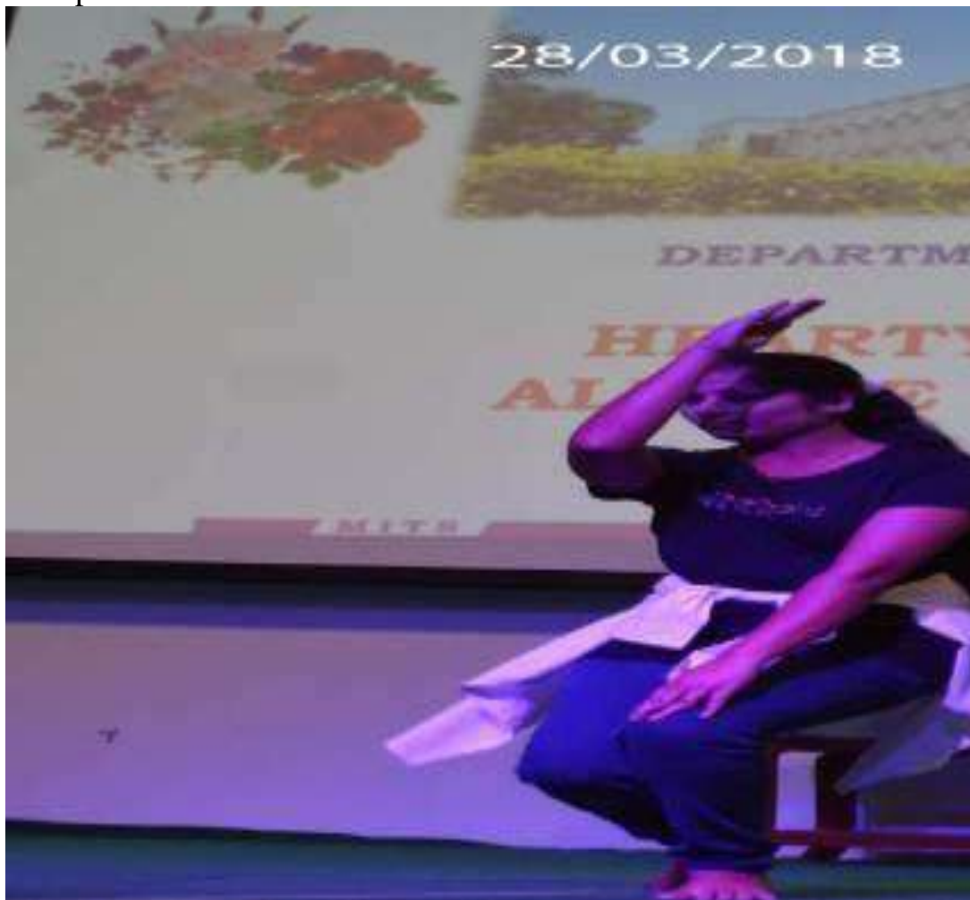
Cultural performance during Eclectica