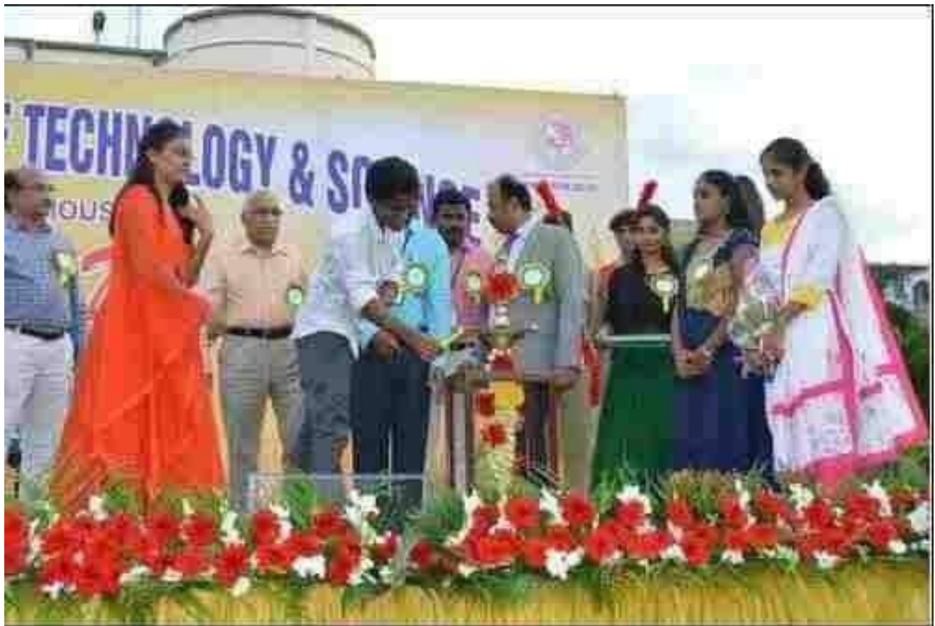
Inauguration of Freshers' Day Celebrations

Freshers' day is one of the memorable days in the lives of students who joined MITS. Freshers' day was the day of excitement, joy, music, laughter and happiness. Senior students extended a warm welcome to juniors emphasizing the achievements of MITS in the past. It was a laudable sight watching most of the youngsters excel in giving best performance on stage. It would be one of the memorable days in the lives of the students who joined MITS. Freshers' day was the day of excitement, joy, music, laughter and happiness. Senior students extended a warm welcome to juniors emphasizing the achievements of MITS in the past. It was a laudable sight watching most of the youngsters excel in giving best performance on stage.