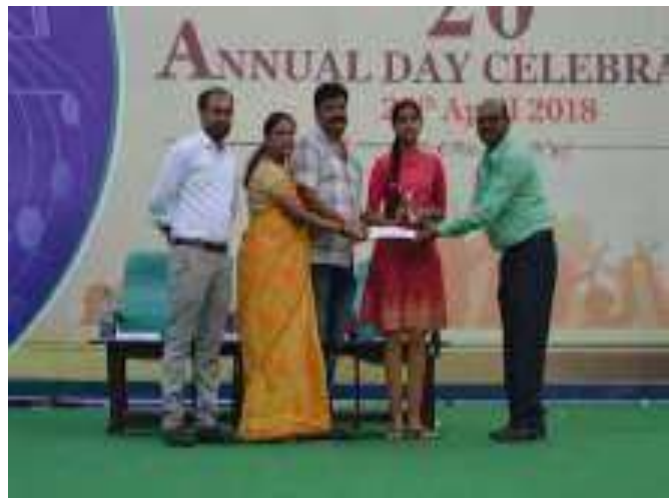
Annual Day Cultural Performances and Prize Distribution