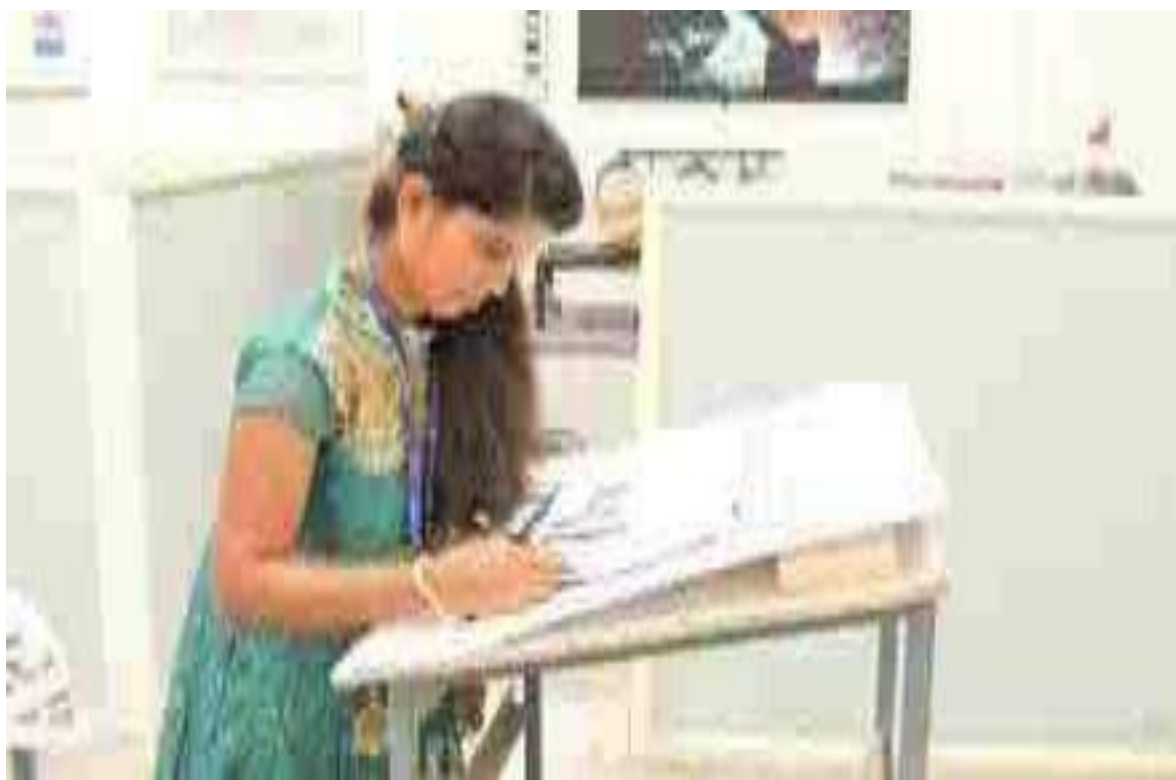
Students participating in Drawing Competition under Arts & Cultural Club

It is the competition exclusively who have fair knowledge in Painting and Drawing. Students might have been trained in painting in their childhood. This platform is the right place for students to execute their talent besides having academic studies. A total number of six students participated in the event. I prize and II prize have been awarded. Judges are the in-house faculty who have knowledge of drawing.