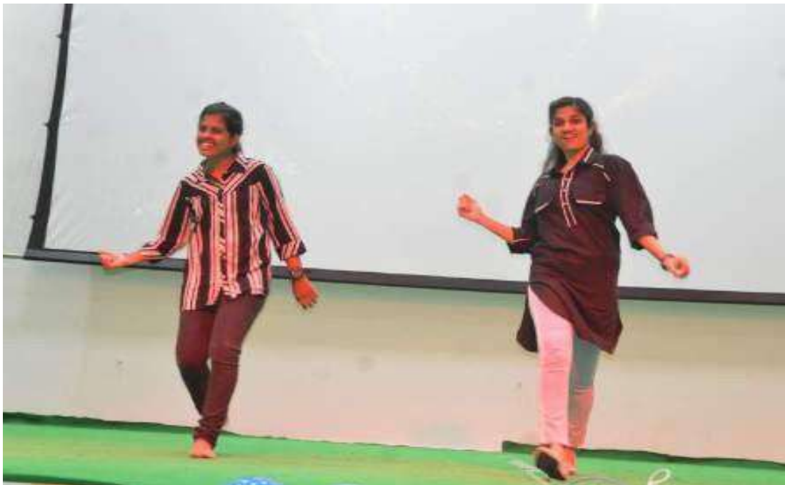
Students Performing during Womens’ Day Celebrations

All the speakers shared their opinion on the importance of women’s day. Games like antakshari, tenni koit, musical chairs and tug of war were conducted for the participants and prizes were distributed. Finally, the program was concluded with a vote of thanks by students.