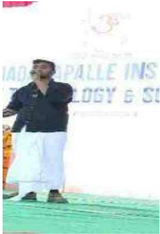
Students participating in Singing Competition during Sa Re Ga Ma Pa under Arts & Cultural Club