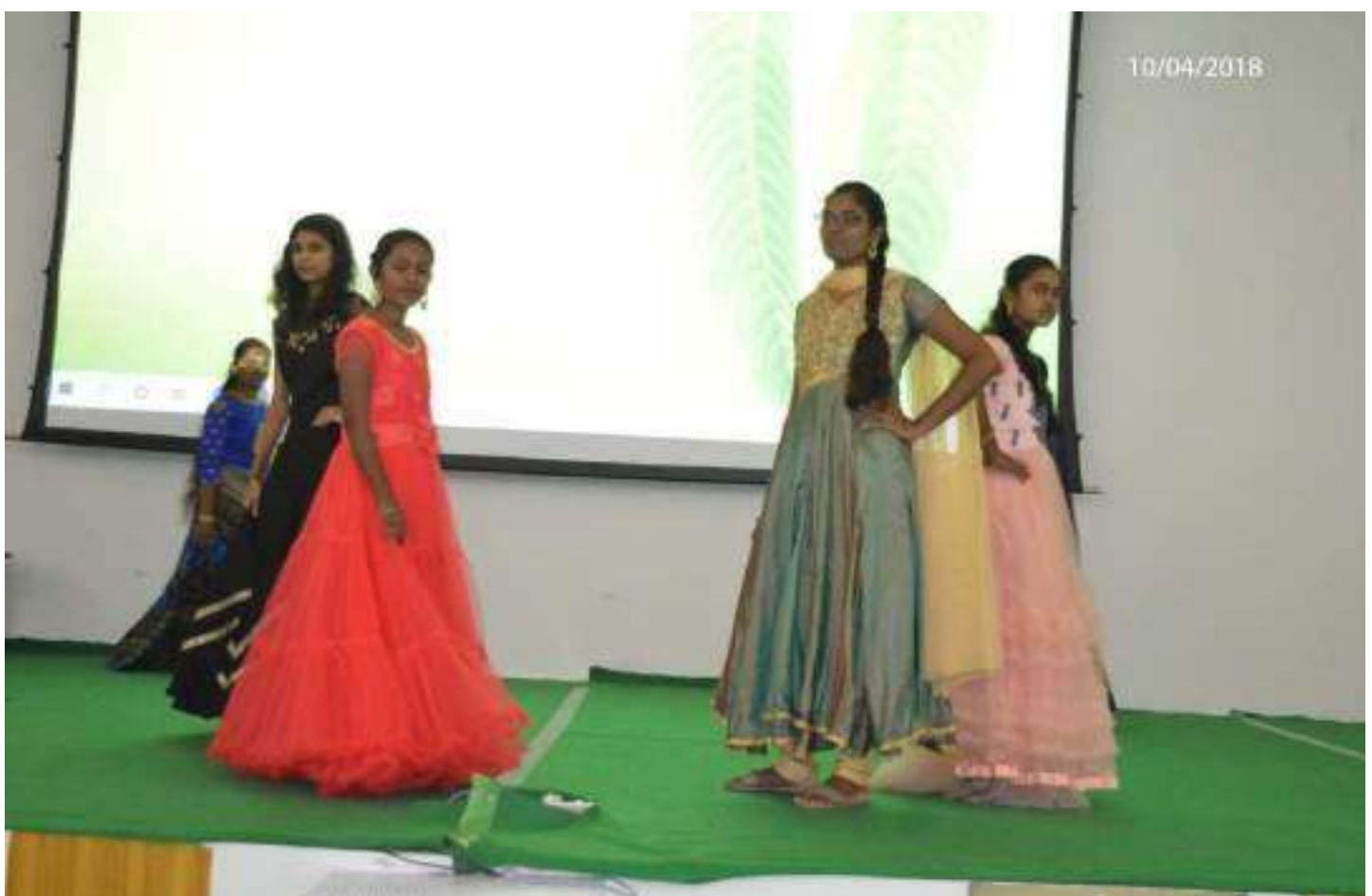
GMOCS – Cultural Events