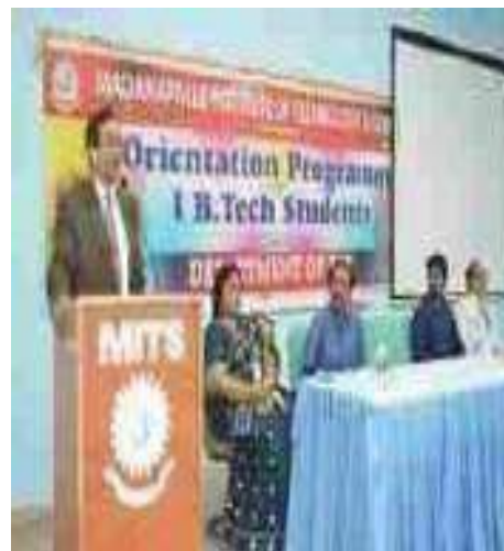
Chief guest delivering during Orientation for I B.tech Students