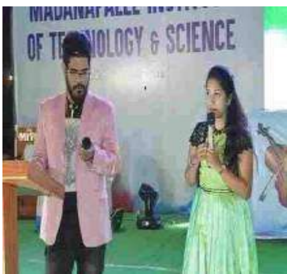
Music Concert during Cultural Fest