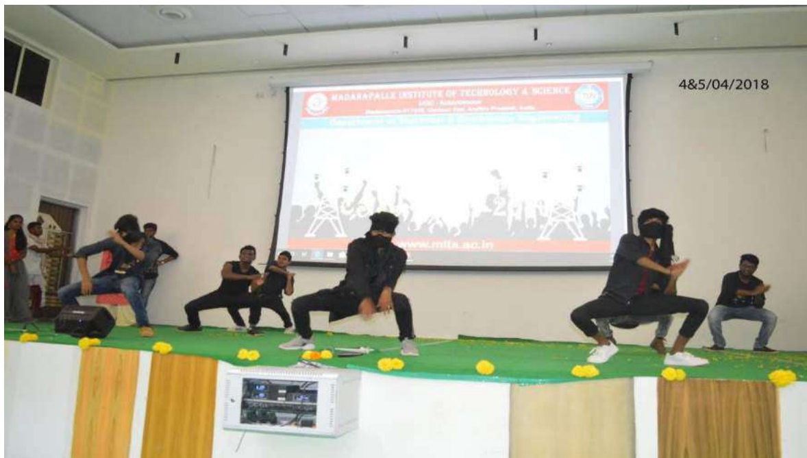
Cultural performance during TERA