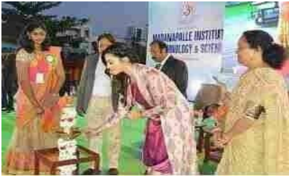
Chief Guest Inaugurating Cultural Fest