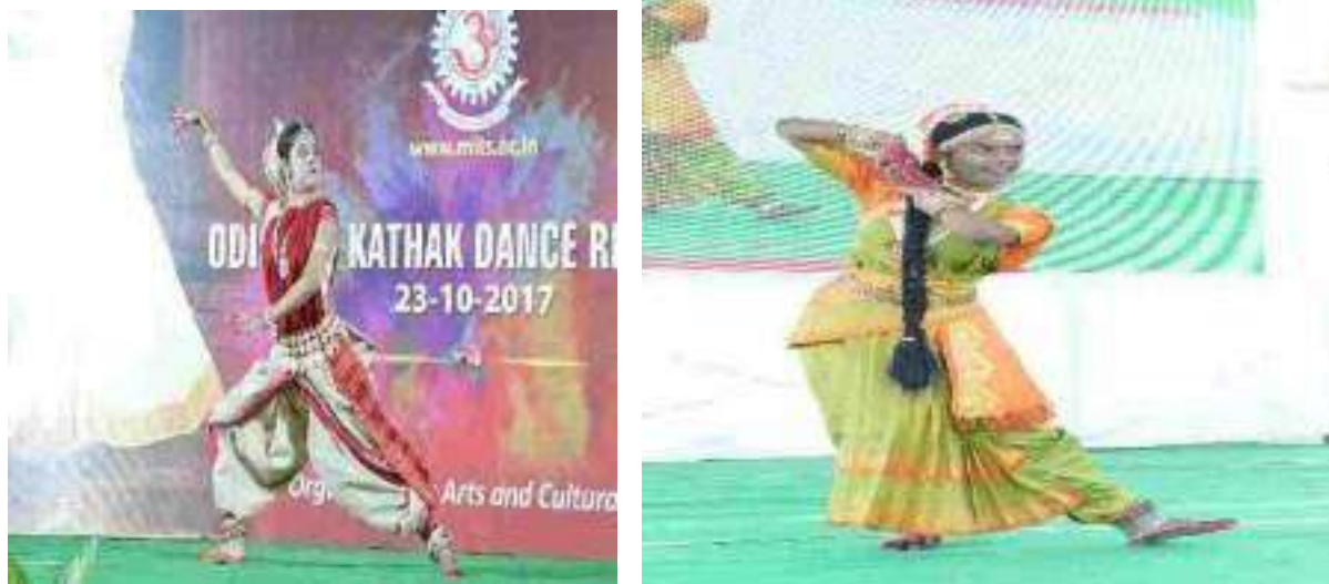
Students participating in Dance Competition under Arts & Cultural Club

students participated in the event. I prize and II prize have been awarded. Judges are the in- house faculty who have knowledge of dancing.