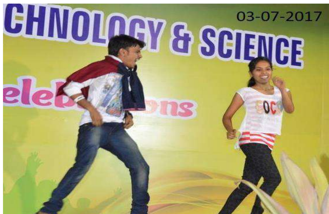
Students cultural program during Orientation Day