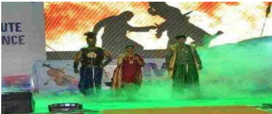
Students participating in Fashion Show under Arts & Cultural Club

It is the competition exclusively who have fair knowledge in Fashion. Students might have been trained in painting in their childhood. This platform is the right place for students to execute their talent besides having academic studies. A total number of twenty students participated in the event. I prize and II prize have been awarded. Judges are the in-house faculty who have knowledge of fashion.