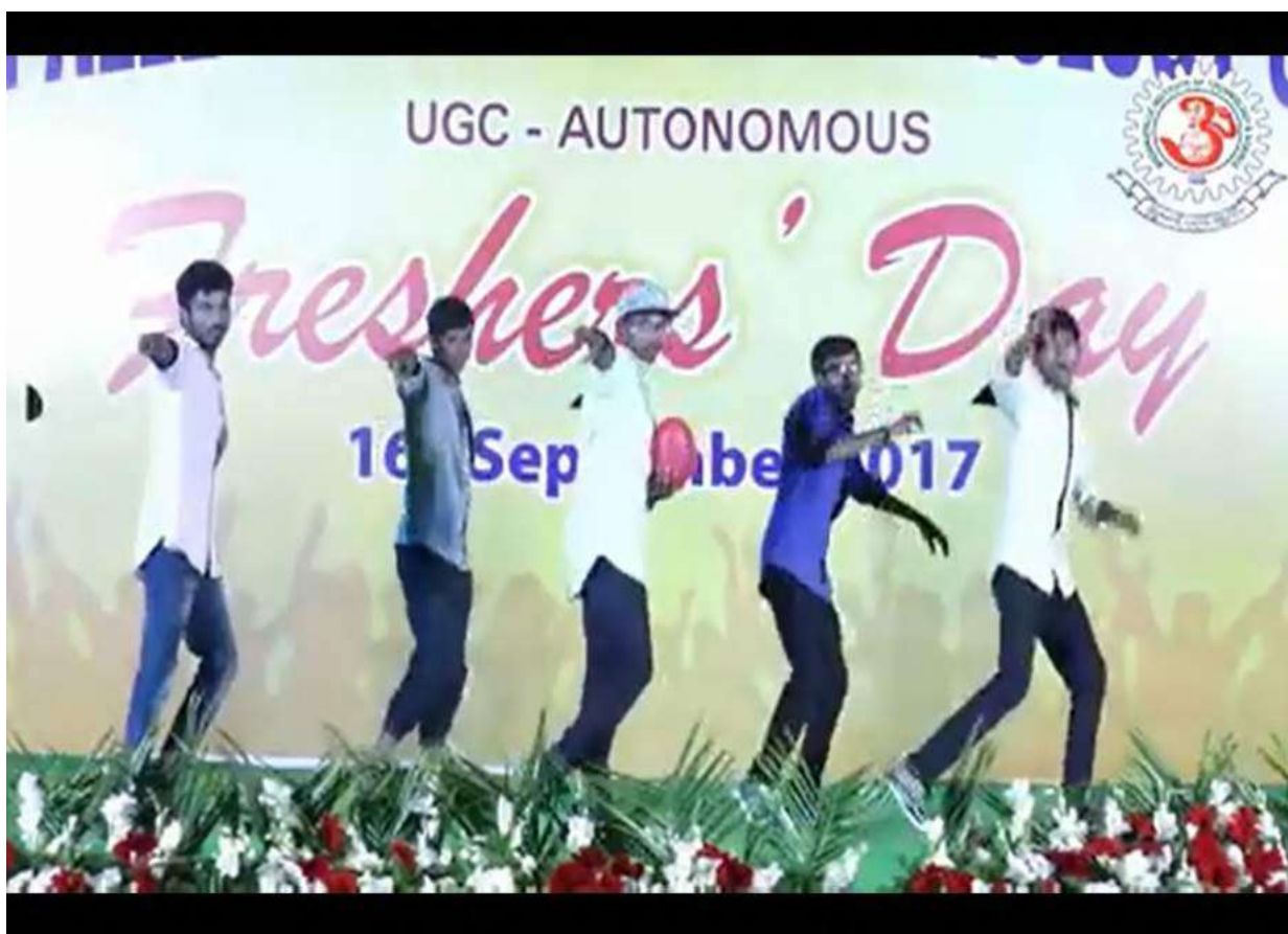
Students performance during Freshers' day celebrations