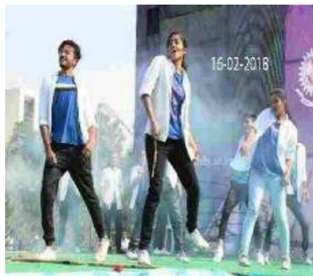
Students Flash Mob during Cultural Fest